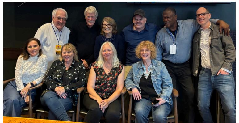
SoCalMWA Get-together at Rock 'n' Reilly's